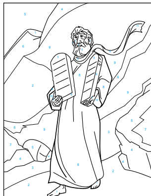
1. Skin 2. Pink 3. Tan 4. Purple 5. Light Gray 6. Gray 7. Dark Gray 8. Light Green 9. Light Blue 10. Dark Green 11. Orange

Color each section by the colors shown in the list at the bottom of the page. If you don't have all of the colors listed or find an area that's not numbered, make your best color choice.