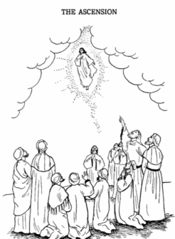
Forty days after Jesus had risen from the dead, He appeared for the last time to the apostles. He was then received up into heaven.